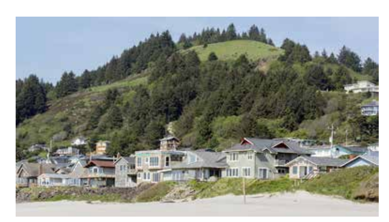
Looking at the Knoll from Roads End beach

http://www.lincolncity.org/index.asp?SEC=876A2A99-6CF5-44FB-8FDE-0D46B08E522F&-Type=B_BASIC