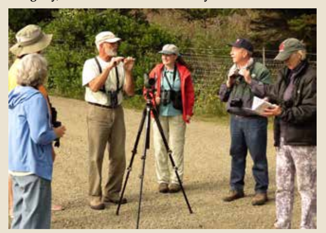
October 2015 Basic Birding class field trip.

Four sessions Tue & Thu, March 1-10, 1:30-3pm $25 Lincoln City Campus, Room 208 Materials Fee: $10 paid to instructor at first class